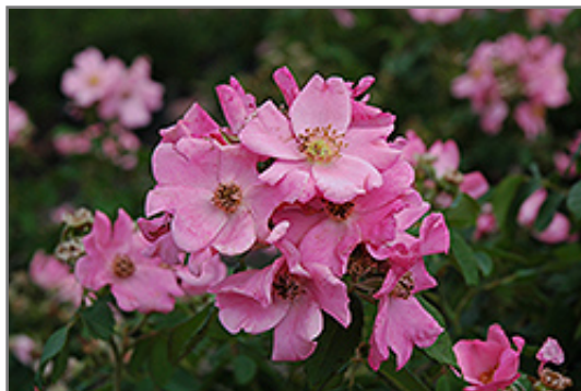
Polar Joy Rose flowers