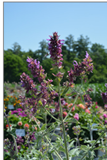
Lancelot Canary Island Sage flowers

Lancelot Canary Island Sage is an herbaceous perennial with an upright spreading habit of growth. Its relatively fine texture sets it apart from other garden plants with less refined foliage.