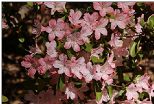
Shin Utena Azalea flowers

Shin Utena Azalea is recommended for the following landscape applications;