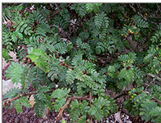
Xanti Mimosa foliage