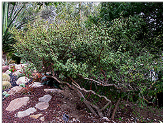
Xanti Mimosa