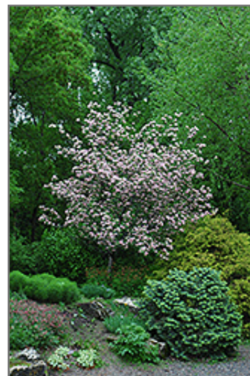
Bechtel's Flowering Crab in bloom