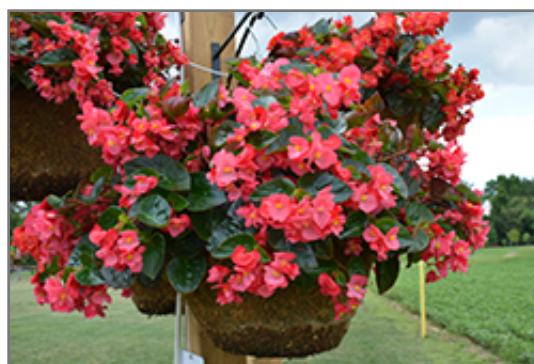
Viking Explorer Rose on Green Begonia in bloom