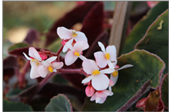
Ramirez Begonia flowers