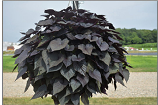
Floramia Cameo Sweet Potato Vine

Floramia Cameo Sweet Potato Vine is recommended for the following landscape applications;