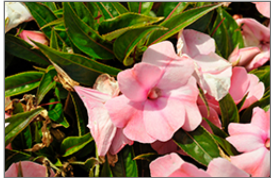
Harmony Colorfall Light Coral Impatiens flowers