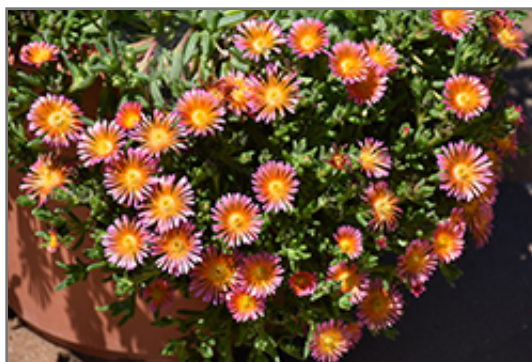
Ocean Sunset Orange Glow Ice Plant flowers