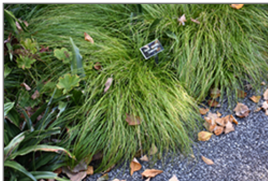
Coahoma Social Sedge