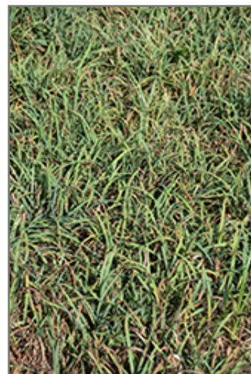
Creeping Sedge