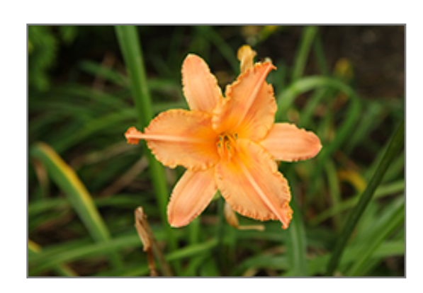
Mango Thrills Daylily flowers