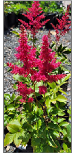
Elisabeth van Veen Astilbe in bloom