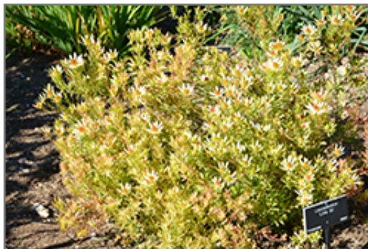
Little Bit Conebush

Little Bit Conebush will grow to be about 3 feet tall at maturity, with a spread of 3 feet. It tends to fill out right to the ground and therefore doesn't necessarily require facer plants in front. It grows at a medium rate, and under ideal conditions can be expected to live for approximately 30 years.