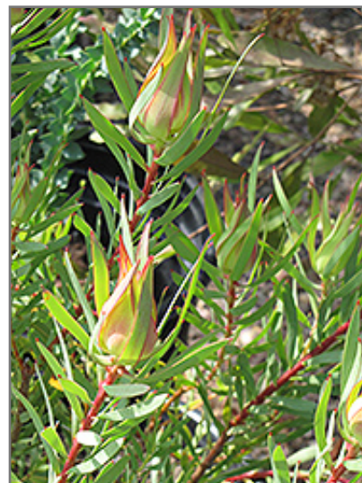
Little Bit Conebush