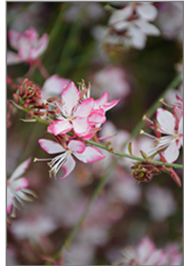
Freefolk Rosy Gaura flowers

This is a relatively low maintenance plant, and is best cleaned up in early spring before it resumes active growth for the season. It is a good choice for attracting butterflies to your yard, but is not particularly attractive to deer who tend to leave it alone in favor of tastier treats. It has no significant negative characteristics.