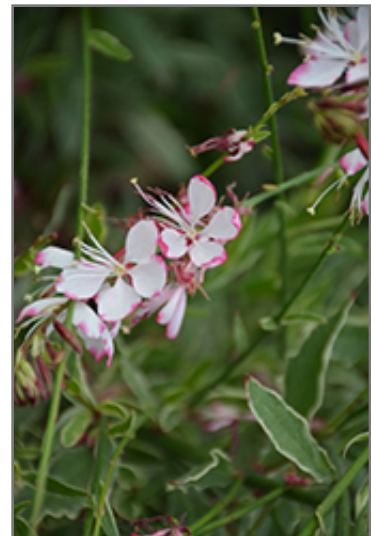
Freefolk Rosy Gaura flowers