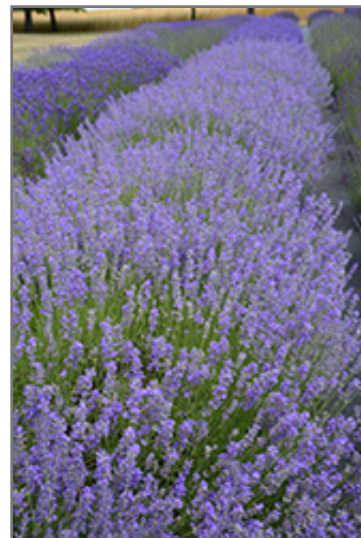
W.K. Doyle Lavender in bloom

W.K. Doyle Lavender is recommended for the following landscape applications;