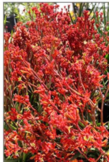
Bush Tango Kangaroo Paw flowers