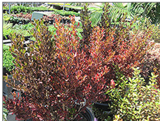
Pacific Sunset Mirror Bush