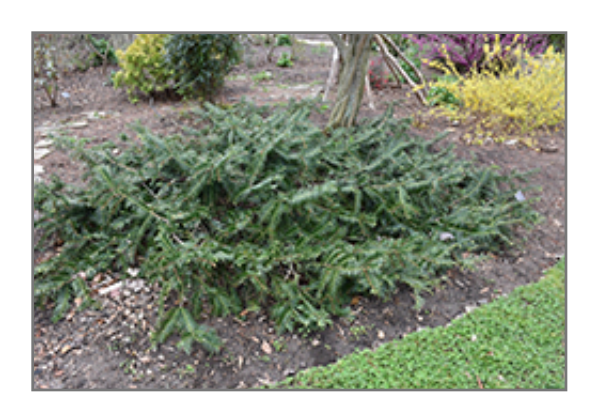
Chinese Plum Yew

A very useful large landscape shrub that is very heat tolerant, more interesting than most junipers, will take more shade than almost any needled evergreen; tolerates severe pruning and makes a great hedge in a shady area; good for foundation planting