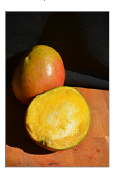
Tommy Atkins Mango fruit and flesh