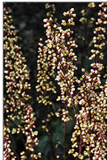
Pink Pearls Foamflower flowers