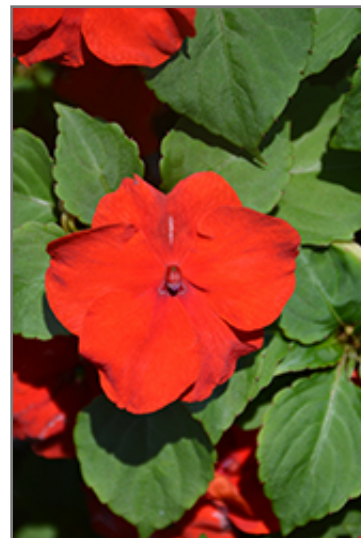
Xtreme Red Impatiens flowers

Xtreme Red Impatiens is recommended for the following landscape applications;