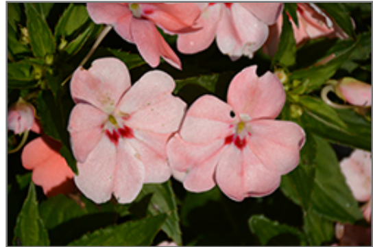
SunStanding Spot On Salmon Impatiens flowers

SunStanding Spot On Salmon Impatiens is recommended for the following landscape applications;