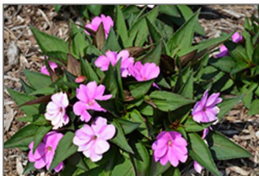
SunStanding Lavender Impatiens in bloom