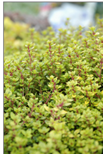
Archer's Gold Thyme flowers