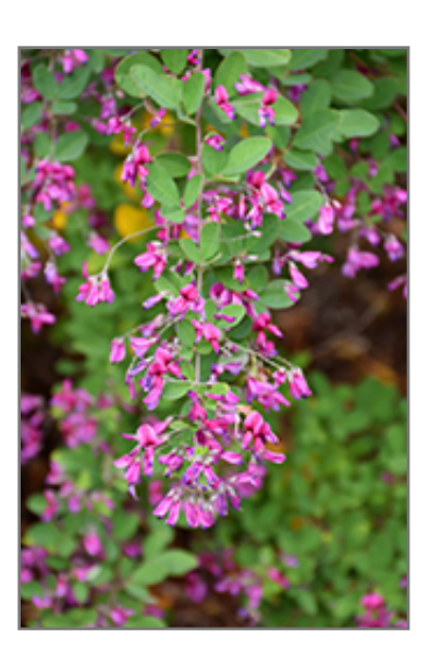
Little Volcano Bush Clover flowers

Little Volcano Bush Clover is recommended for the following landscape applications;