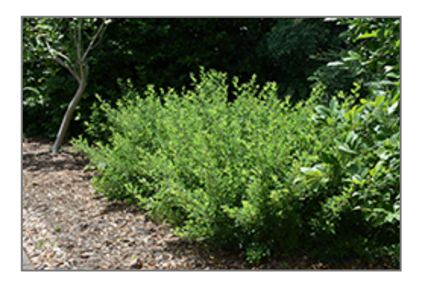
Little Volcano Bush Clover

Little Volcano Bush Clover will grow to be about 6 feet tall at maturity, with a spread of 10 feet. It tends to fill out right to the ground and therefore doesn't necessarily require facer plants in front, and is suitable for planting under power lines. It grows at a slow rate, and under ideal conditions can be expected to live for approximately 10 years.