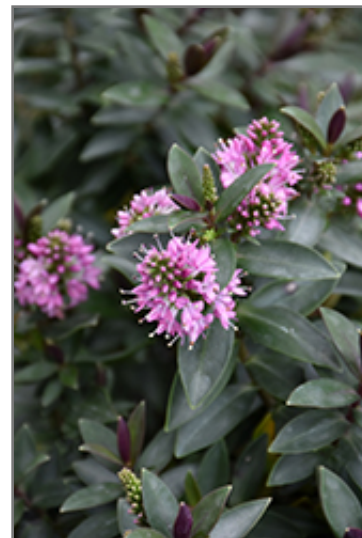
Pretty In Pink Hebe flowers

Pretty In Pink Hebe is recommended for the following landscape applications;