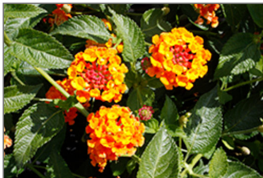
Landscape Bandana® Clementine Lantana flowers

This is a relatively low maintenance shrub, and should not require much pruning, except when necessary, such as to remove dieback. It is a good choice for attracting bees, butterflies and hummingbirds to your yard, but is not particularly attractive to deer who tend to leave it alone in favor of tastier treats. It has no significant negative characteristics.