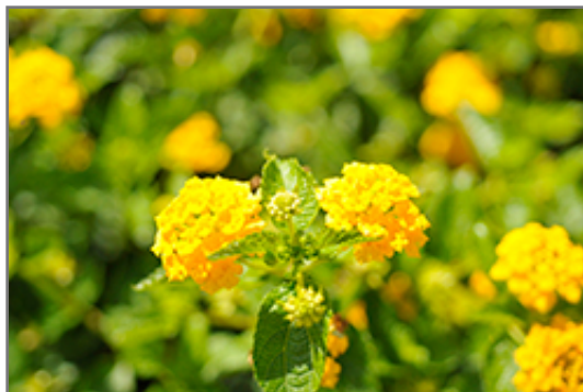
Landmark Gold Lantana flowers

This is a relatively low maintenance shrub, and should not require much pruning, except when necessary, such as to remove dieback. It is a good choice for attracting bees, butterflies and hummingbirds to your yard, but is not particularly attractive to deer who tend to leave it alone in favor of tastier treats. It has no significant negative characteristics.