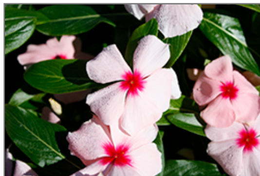
Cora XDR Apricot flowers