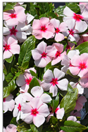
Cora XDR Apricot flowers

Cora XDR Apricot is recommended for the following landscape applications;