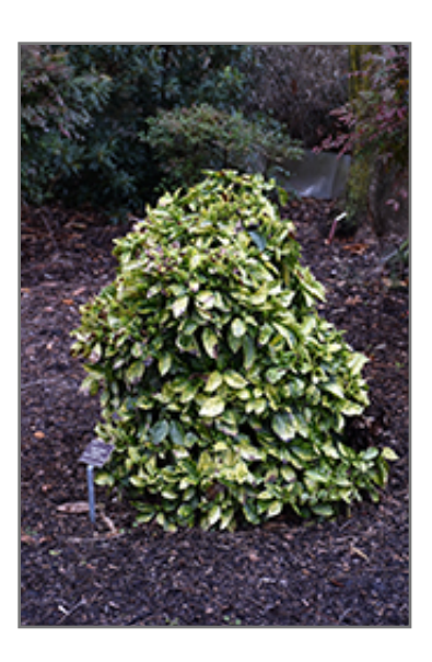
Goldilocks Aucuba

When grown indoors, Goldilocks Aucuba can be expected to grow to be about 5 feet tall at maturity, with a spread of 4 feet. It grows at a slow rate, and under ideal conditions can be expected to live for approximately 20 years. This houseplant performs well in both bright or indirect sunlight and strong artificial light, and can therefore be situated in almost any well-lit room or location. It does best in average to evenly moist soil, but will not tolerate standing water. The surface of the soil shouldn't be allowed to dry out completely, and so you should expect to water this plant once and possibly even twice each week. Be aware that your particular watering schedule may vary depending on its location in the room, the pot size, plant size and other conditions; if in doubt, ask one of our experts in the store for advice. It is not particular as to soil pH, but grows best in rich soil. Contact the store for specific recommendations on pre-mixed potting soil for this plant.