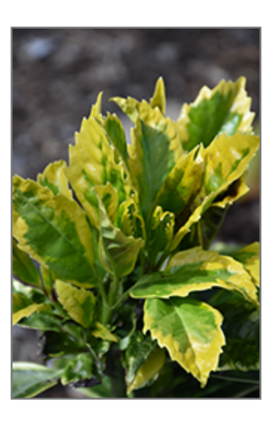
Eclipse Aucuba foliage

When grown indoors, Eclipse Aucuba can be expected to grow to be about 3 feet tall at maturity, with a spread of 3 feet. It grows at a slow rate, and under ideal conditions can be expected to live for approximately 20 years. This houseplant performs well in both bright or indirect sunlight and strong artificial light, and can therefore be situated in almost any well-lit room or location. It does best in average to evenly moist soil, but will not tolerate standing water. The surface of the soil shouldn't be allowed to dry out completely, and so you should expect to water this plant once and possibly even twice each week. Be aware that your particular watering schedule may vary depending on its location in the room, the pot size, plant size and other conditions; if in doubt, ask one of our experts in the store for advice. It is not particular as to soil pH, but grows best in rich soil. Contact the store for specific recommendations on pre-mixed potting soil for this plant.