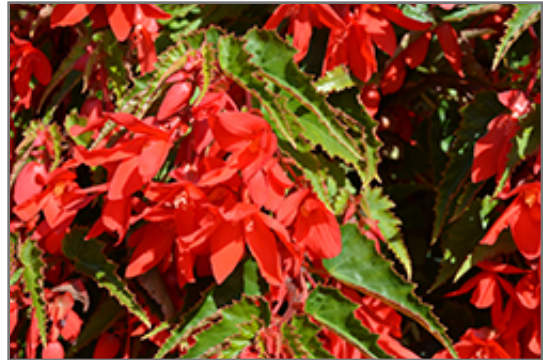
Bossa Nova Red Begonia flowers

Bossa Nova Red Begonia is recommended for the following landscape applications;