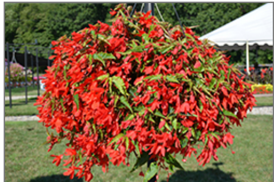
Bossa Nova Red Begonia in bloom