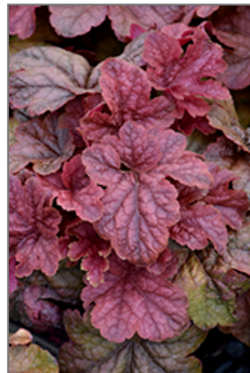
Peach Tea Foamy Bells foliage

Peach Tea Foamy Bells is recommended for the following landscape applications;