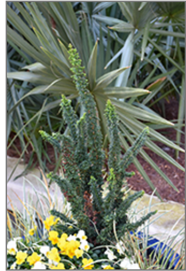
Habari Hinoki Falsecypress

Habari Hinoki Falsecypress makes a fine choice for the outdoor landscape, but it is also well-suited for use in outdoor pots and containers. With its upright habit of growth, it is best suited for use as a 'thriller' in the 'spiller-thriller-filler' container combination; plant it near the center of the pot, surrounded by smaller plants and those that spill over the edges. Note that when grown in a container, it may not perform exactly as indicated on the tag - this is to be expected. Also note that when growing plants in outdoor containers and baskets, they may require more frequent waterings than they would in the yard or garden.