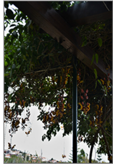
Brick & Butter Vine in bloom

Brick & Butter Vine makes a fine choice for the outdoor landscape, but it is also well-suited for use in outdoor pots and containers. Because of its spreading habit of growth, it is ideally suited for use as a 'spiller' in the 'spiller-thriller-filler' container combination; plant it near the edges where it can spill gracefully over the pot. It is even sizeable enough that it can be grown alone in a suitable container. Note that when grown in a container, it may not perform exactly as indicated on the tag - this is to be expected. Also note that when growing plants in outdoor containers and baskets, they may require more frequent waterings than they would in the yard or garden.