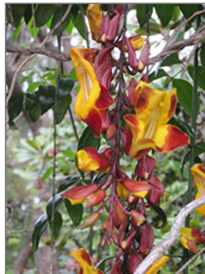
Brick & Butter Vine flowers

Brick & Butter Vine is recommended for the following landscape applications;