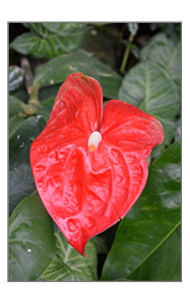
Kozohara Anthurium flowers

When grown indoors, Kozohara Anthurium can be expected to grow to be about 18 inches tall at maturity, with a spread of 18 inches. It grows at a medium rate, and under ideal conditions can be expected to live for approximately 5 years. This houseplant performs well in both bright or indirect sunlight and strong artificial light, and can therefore be situated in almost any well-lit room or location. It does best in average to evenly moist soil, but will not tolerate standing water. The surface of the soil shouldn't be allowed to dry out completely, and so you should expect to water this plant once and possibly even twice each week. Be aware that your particular watering schedule may vary depending on its location in the room, the pot size, plant size and other conditions; if in doubt, ask one of our experts in the store for advice. It is not particular as to soil type, but has a definite preference for acidic soil. Contact the store for specific recommendations on pre-mixed potting soil for this plant. Be warned that parts of this plant are known to be toxic to humans and animals, so special care should be exercised if growing it around children and pets.