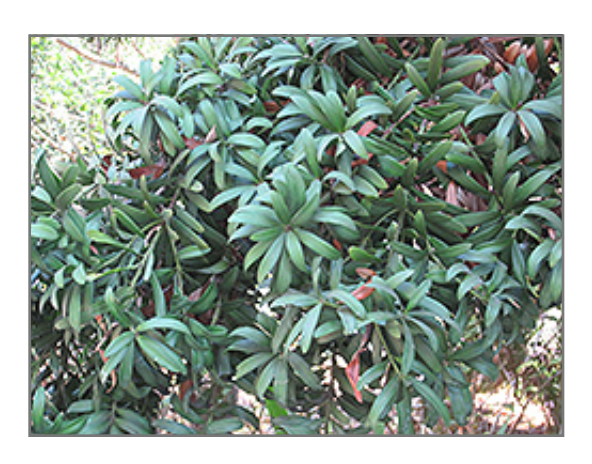
Yellowwood foliage