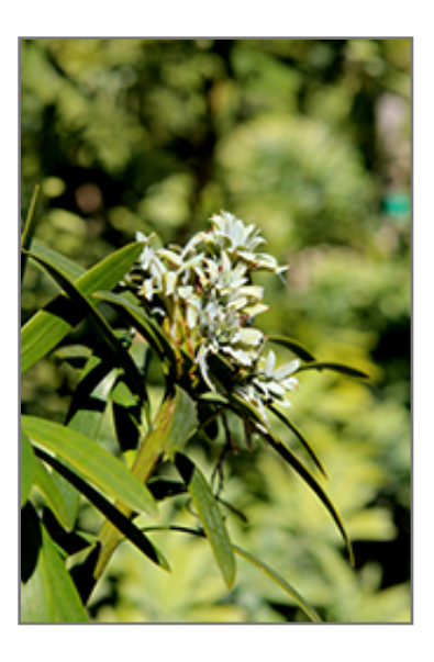
Yellowwood flowers

This tree does best in full sun to partial shade. It does best in average to evenly moist conditions, but will not tolerate standing water. It is not particular as to soil type or pH. It is somewhat tolerant of urban pollution. This species is not originally from North America.