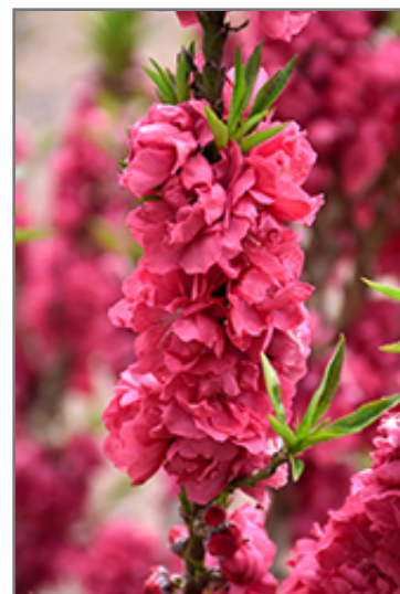
NCSU Dwarf Double Red Flowering Peach flowers

NCSU Dwarf Double Red Flowering Peach is recommended for the following landscape applications;