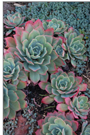
Blue Mist Echeveria

Blue Mist Echeveria is recommended for the following landscape applications;