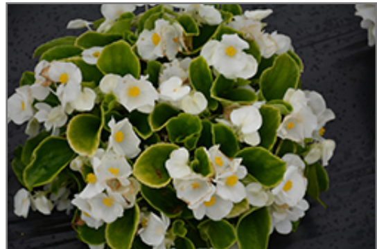
Sprint Plus White Begonia in bloom