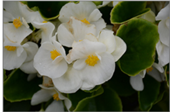
Sprint Plus White Begonia flowers

This is a high maintenance plant that will require regular care and upkeep, and usually looks its best without pruning, although it will tolerate pruning. Deer don't particularly care for this plant and will usually leave it alone in favor of tastier treats. Gardeners should be aware of the following characteristic(s) that may warrant special consideration;