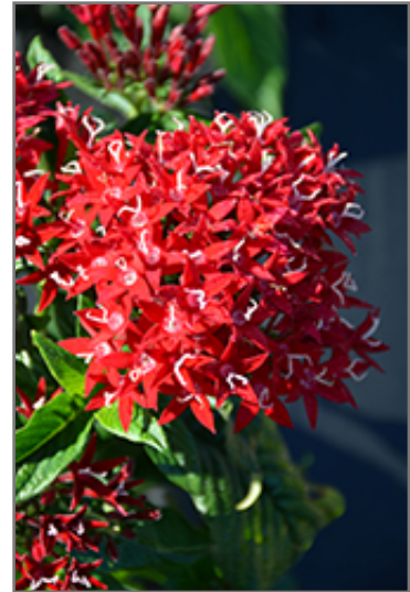
Graffiti OG Red Velvet Star Flower flowers

Graffiti OG Red Velvet Star Flower is recommended for the following landscape applications;