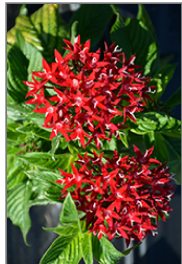
Graffiti OG Red Velvet Star Flower flowers