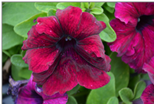
Success! HD Burgundy Petunia flowers

This plant will require occasional maintenance and upkeep. Trim off the flower heads after they fade and die to encourage more blooms late into the season. It is a good choice for attracting hummingbirds to your yard, but is not particularly attractive to deer who tend to leave it alone in favor of tastier treats. It has no significant negative characteristics.