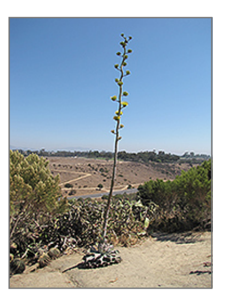
El Camaron Butterfly Agave in bloom

El Camaron Butterfly Agave makes a fine choice for the outdoor landscape, but it is also well-suited for use in outdoor pots and containers. Its large size and upright habit of growth lend it for use as a solitary accent, or in a composition surrounded by smaller plants around the base and those that spill over the edges. It is even sizeable enough that it can be grown alone in a suitable container. Note that when grown in a container, it may not perform exactly as indicated on the tag - this is to be expected. Also note that when growing plants in outdoor containers and baskets, they may require more frequent waterings than they would in the yard or garden.