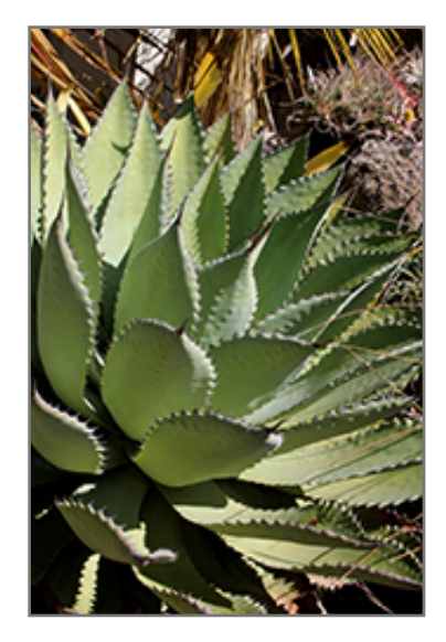
El Camaron Butterfly Agave

This shrub will require occasional maintenance and upkeep, and usually looks its best without pruning, although it will tolerate pruning. Deer don't particularly care for this plant and will usually leave it alone in favor of tastier treats. Gardeners should be aware of the following characteristic(s) that may warrant special consideration;