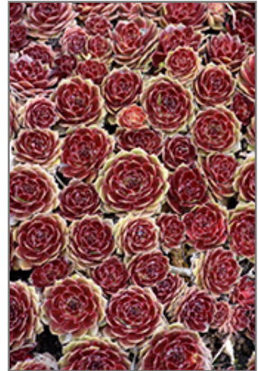
Rocknoll Rosette Hens And Chicks