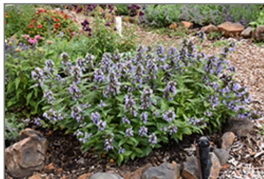
Blue Panther Catmint in bloom