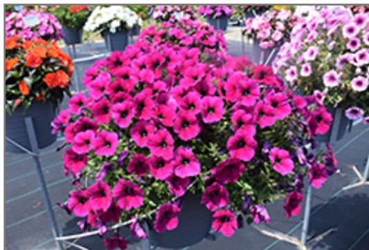
Sanguna Patio Purple Petunia in bloom

Sanguna Patio Purple Petunia is a fine choice for the garden, but it is also a good selection for planting in outdoor containers and hanging baskets. It is often used as a 'filler' in the 'spiller-thriller-filler' container combination, providing a mass of flowers against which the larger thriller plants stand out. Note that when growing plants in outdoor containers and baskets, they may require more frequent waterings than they would in the yard or garden.