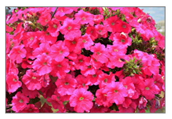
Sanguna Rose Petunia flowers

This plant will require occasional maintenance and upkeep. Trim off the flower heads after they fade and die to encourage more blooms late into the season. It is a good choice for attracting butterflies and hummingbirds to your yard, but is not particularly attractive to deer who tend to leave it alone in favor of tastier treats. It has no significant negative characteristics.