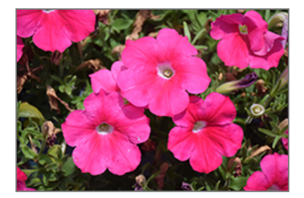
Sanguna Rose Petunia flowers

Sanguna Rose Petunia is a dense herbaceous annual with a trailing habit of growth, eventually spilling over the edges of hanging baskets and containers. Its medium texture blends into the garden, but can always be balanced by a couple of finer or coarser plants for an effective composition.