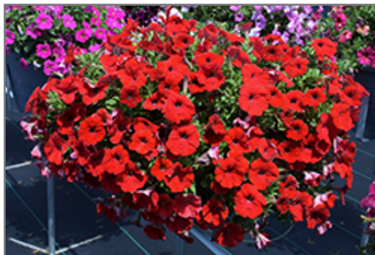
Capella Ruby Red Petunia in bloom

Capella Ruby Red Petunia is a fine choice for the garden, but it is also a good selection for planting in outdoor containers and hanging baskets. It is often used as a 'filler' in the 'spiller-thriller-filler' container combination, providing a mass of flowers against which the thriller plants stand out. Note that when growing plants in outdoor containers and baskets, they may require more frequent waterings than they would in the yard or garden.